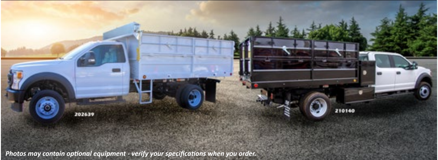
Photos may contain optional equipment - verify your specifications when you order.